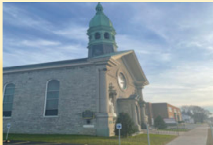
Our Lady Help of Christians