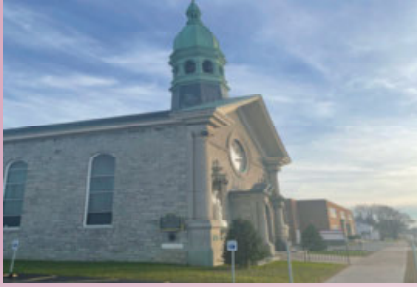
Our Lady Help of Christians