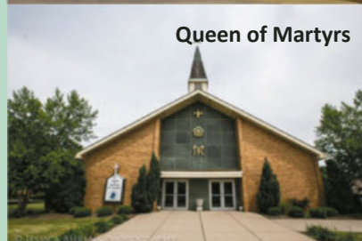
Queen of Martyrs