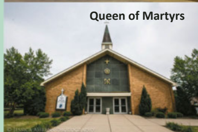
Queen of Martyrs