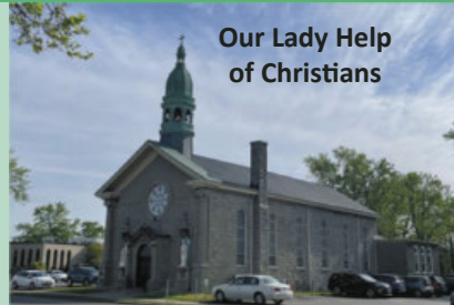
Our Lady Help of Christians