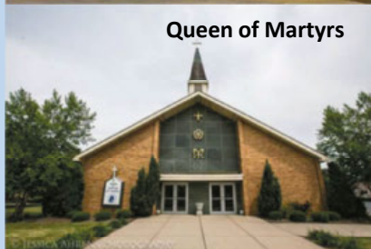
Queen of Martyrs