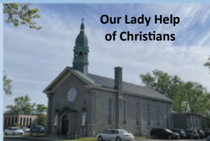
Our Lady Help of Christians