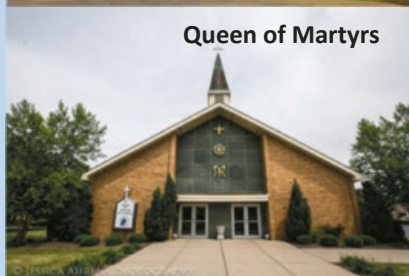
Queen of Martyrs