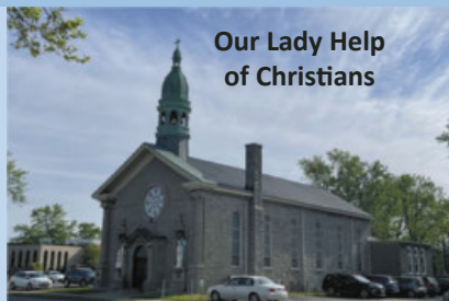
Our Lady Help of Christians