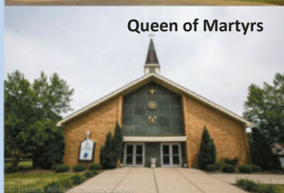
Queen of Martyrs