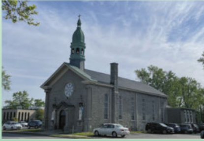
Our Lady Help of Christians