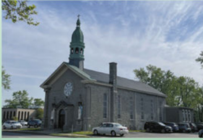
Our Lady Help of Christians