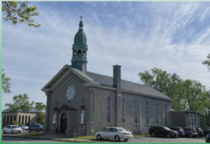
Our Lady Help of Christians