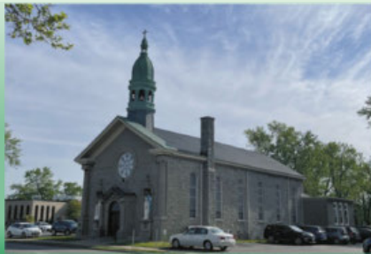
Our Lady Help of Christians