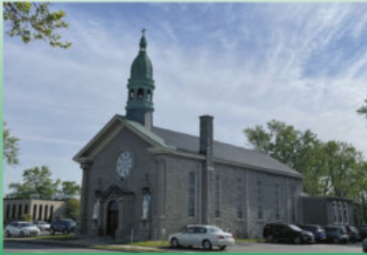
Our Lady Help of Christians