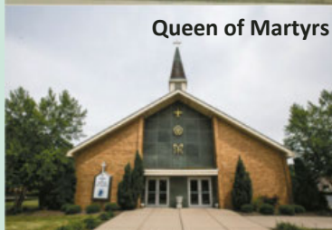
Queen of Martyrs