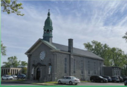
Our Lady Help of Christians