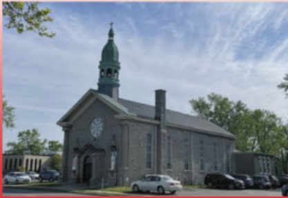
Our Lady Help of Christians