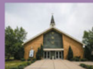
Queen of Martyrs