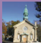
Maria Hilf Chapel