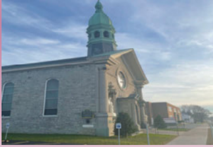
Our Lady Help of Christians