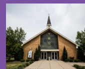
Queen of Martyrs