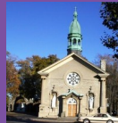
Maria Hilf Chapel