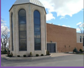
Our Lady Help of Christians