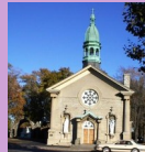
Maria Hilf Chapel