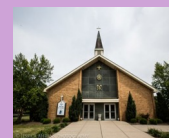
Queen of Martyrs