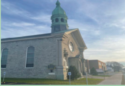
Our Lady Help of Christians