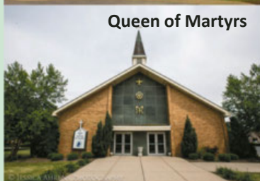
Queen of Martyrs