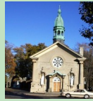
Maria Hilf Chapel