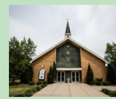
Queen of Martyrs