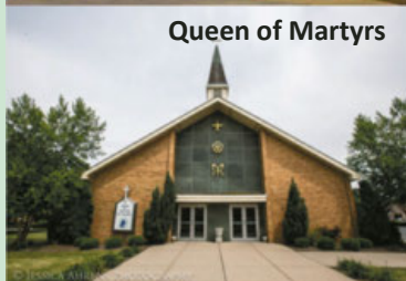
Queen of Martyrs