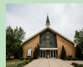
Queen of Martyrs