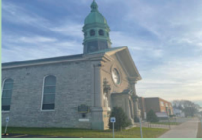
Our Lady Help of Christians