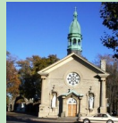
Maria Hilf Chapel