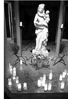
Our Lady Queen of Peace Mount Saviour Monastery, Crypt, circa 15 th Century