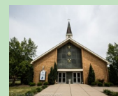
Queen of Martyrs