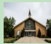
Queen of Martyrs