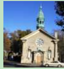
Maria Hilf Chapel