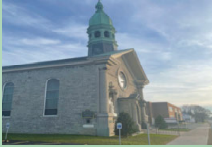
Our Lady Help of Christians