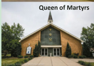
Queen of Martyrs