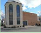
Our Lady Help of Christians