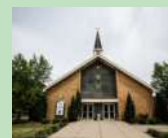
Queen of Martyrs