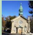
Maria Hilf Chapel