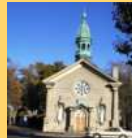
Maria Hilf Chapel