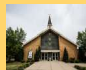
Queen of Martyrs